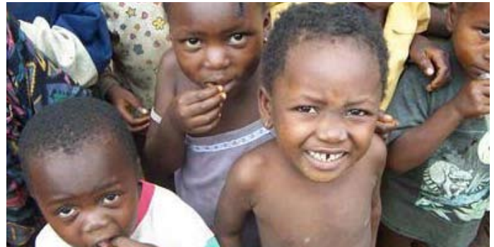
Concerted efforts are needed to educate society on the consequences of stigmatizing children because of their HIV/AIDS status