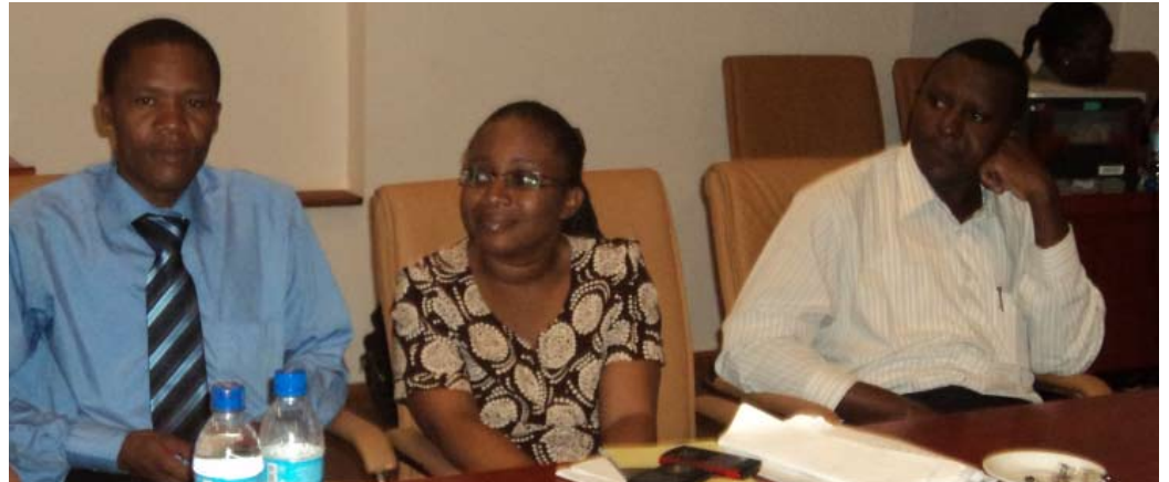
Baadhi ya washiriki wakisikiliza kwa makini, mada za mkutano huo, katika ukumbi wa Tanga Beach Resort