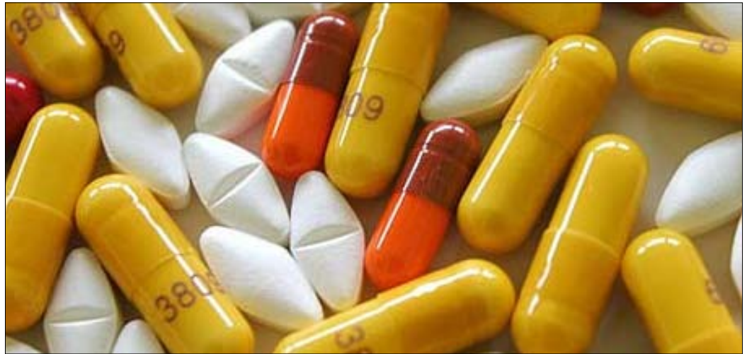
When shortage of ARVs supply brings about woes to poor and developing nations