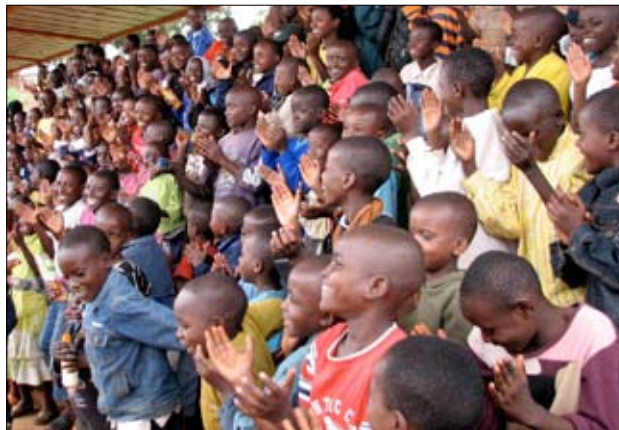
Watoto kama wanaoishi na VVU bila shaka wanakitu cha kiifundisha jamii yetu

Walisema hayo hivi kari-buni wakati walipokuwa wakizungumza na Nipashe mjini hapa. Wamesema mara kadhaa watoto wamekuwa