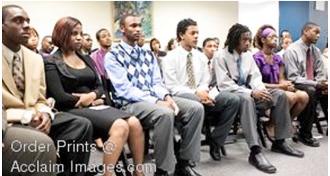
Young generation of the age ranging between 25 and 49 years are at great risk of being infected with HIV

He suggested that the graduands should work with stakeholders not forgetting the NGOs. The trainees were asked to prepare an action plan and work with