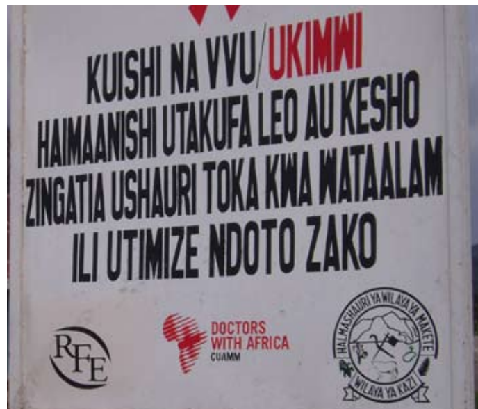
HIV/AIDS prevention adverts are many in Dar es Salaam, in the regions as well as districts. But do people take trouble to read them and take their messages?

sternly. "In what world do you live? Don't you see? Don't you hear?" Yet another one warns, "Stop you greed!" To many people in Africa still, talking of greed where sex is concerned is like playing the guitar to a goat.