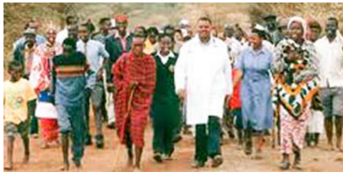
HIV and AIDS awareness programmes are needed at a sustained basis to reduce HIV infections in many parts of Tanzania)

of the surrounding communities will be the secondary target audience.