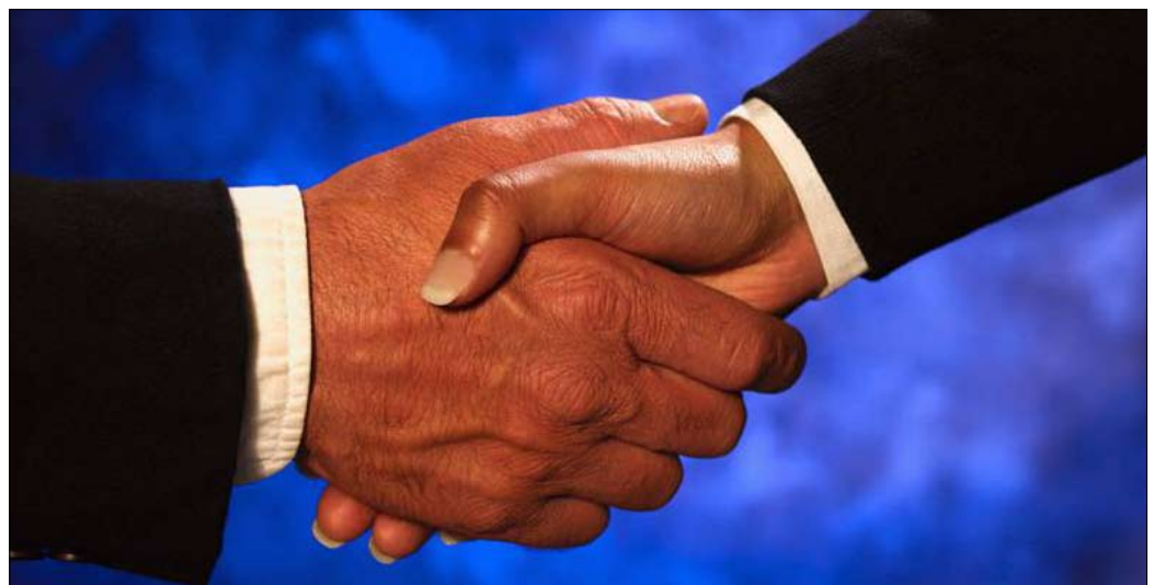
Working together with shared goals and interests against HIV/AIDS through Public-Private Partnerships (PPP) could help to reduce prevalence of HIV infection in the country

It was observed that while some big business men’s products were being distributed in every corner of the country, it was dis-