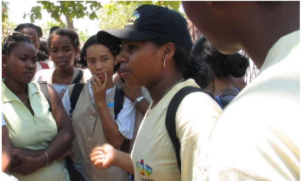
These HIV/AIDS peer educators are essential components in the efforts to reduce HIV infection in the country