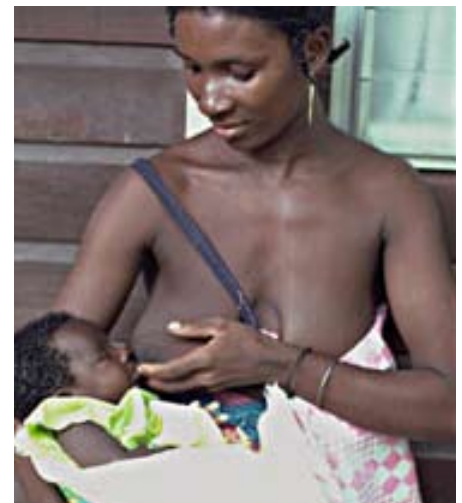
Breastfeeding has long been proved to be the best compared to formula feeding method

ment of Health official, working mothers were also not adequately supported and often stopped breastfeeding once they returned to work as most working environments made it difficult to breastfeed.