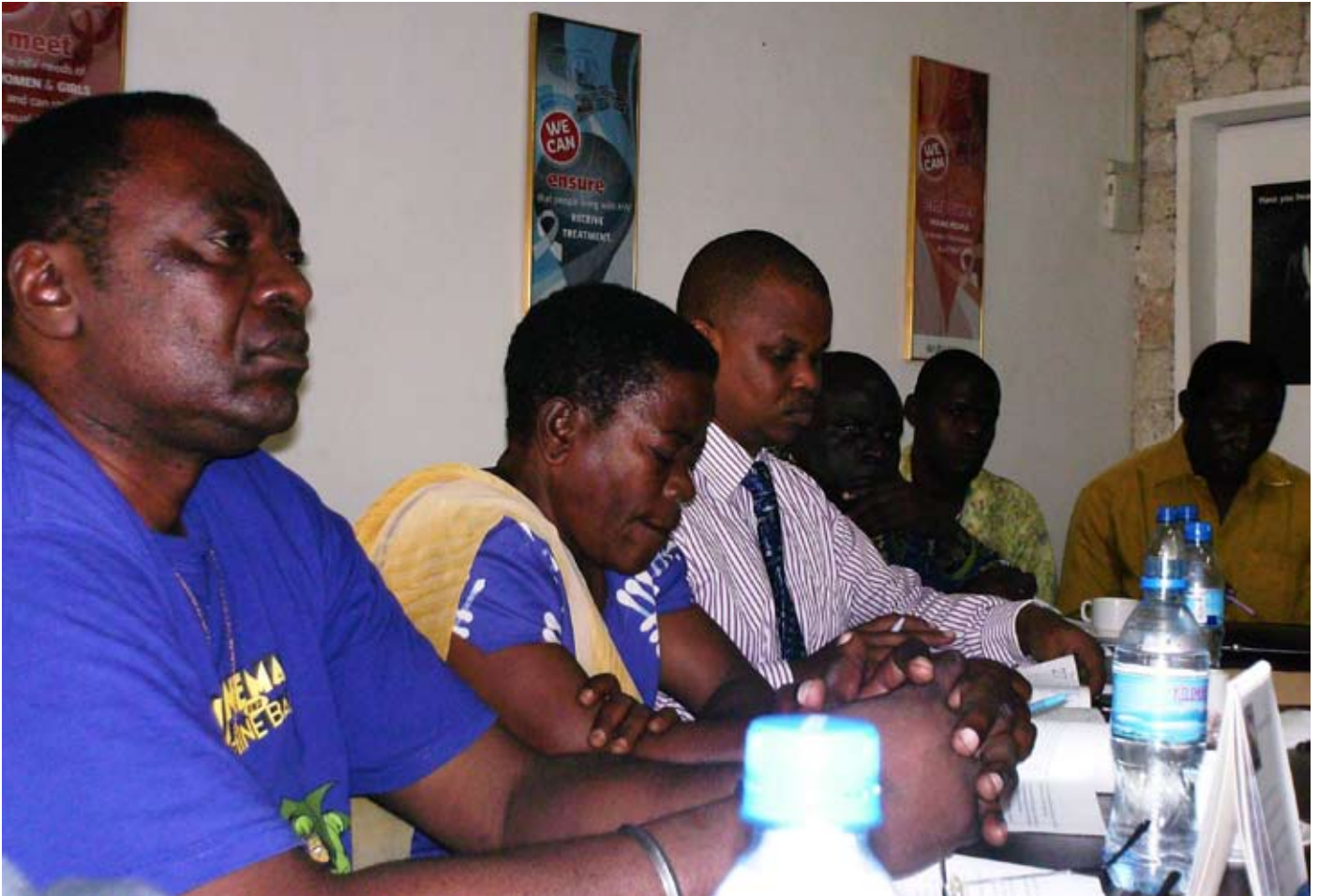
A section of NACOPHA members addressing the press