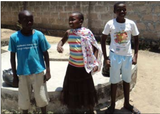
School kids and beneficiaries at WAMATO