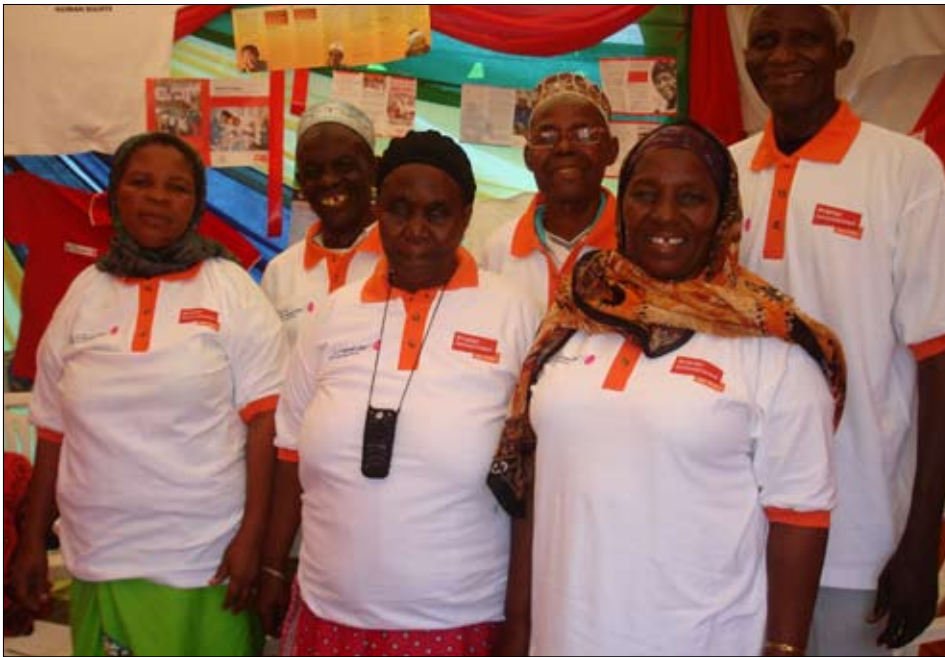
A group of senior citizen as captured in 2009 by AJAAT team during WAD held in Tanga Region